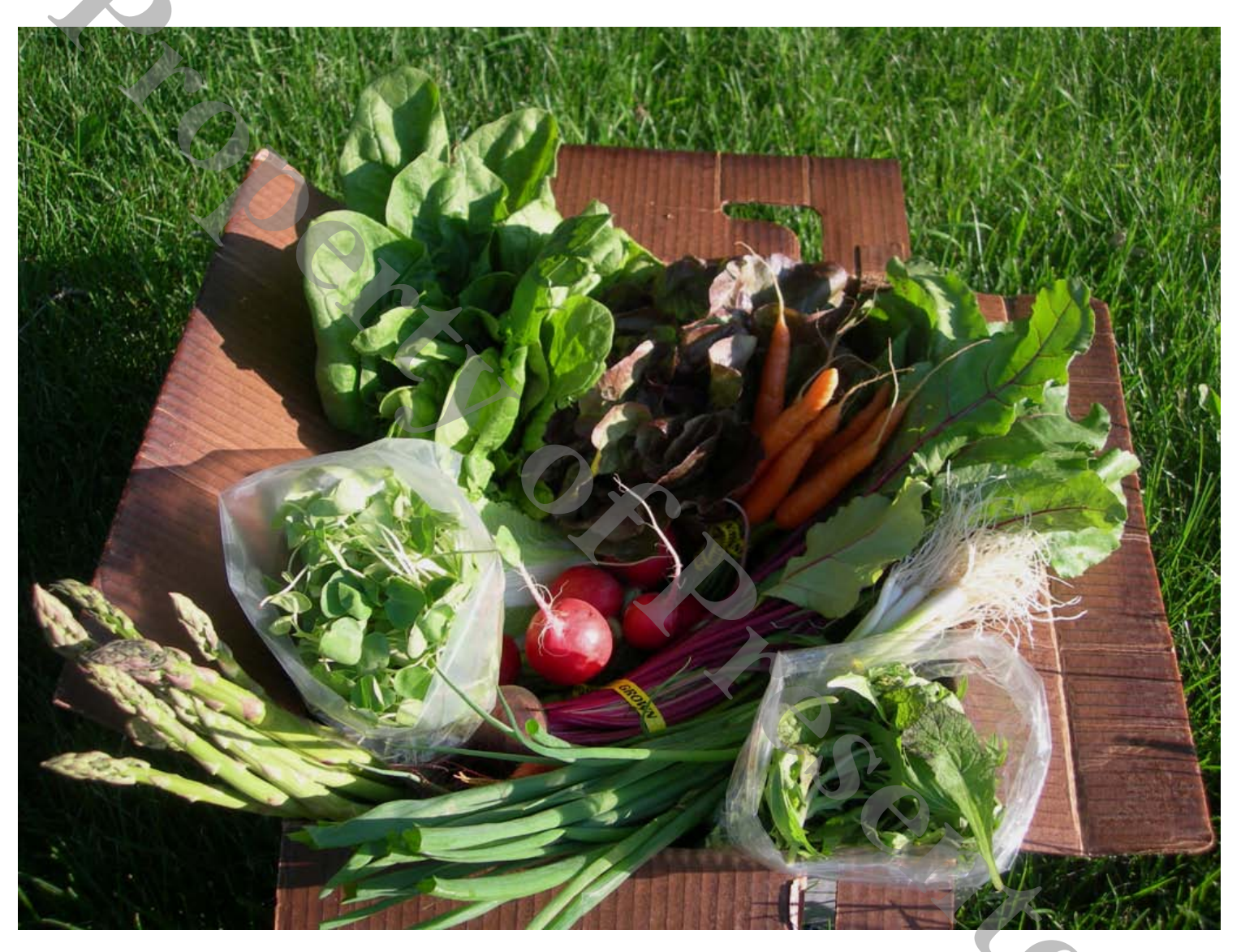
A typical early June box: baby beets, baby carrots, sprouts, head lettuce, asparagus, spinach, green onions and asian cooking greens.