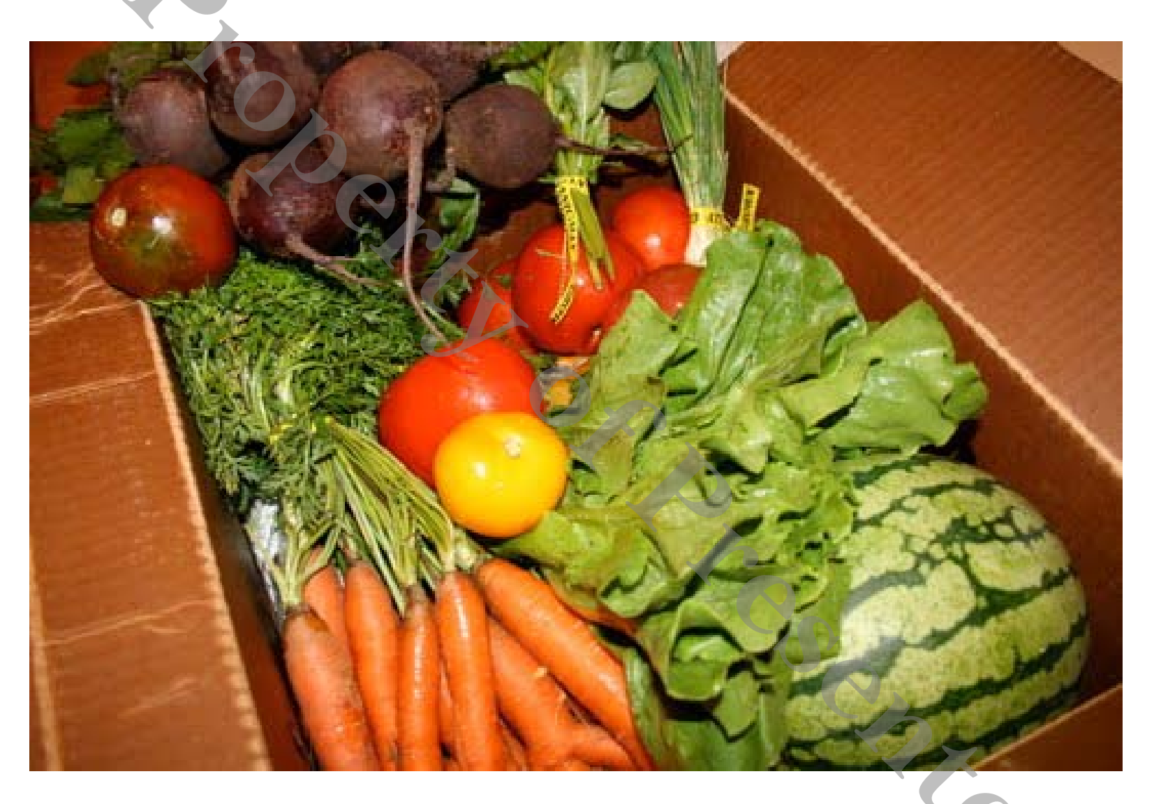
A typical late August box: carrots, watermelon, head lettuce, assorted tomatoes, basil, green beans, beets, green onions.